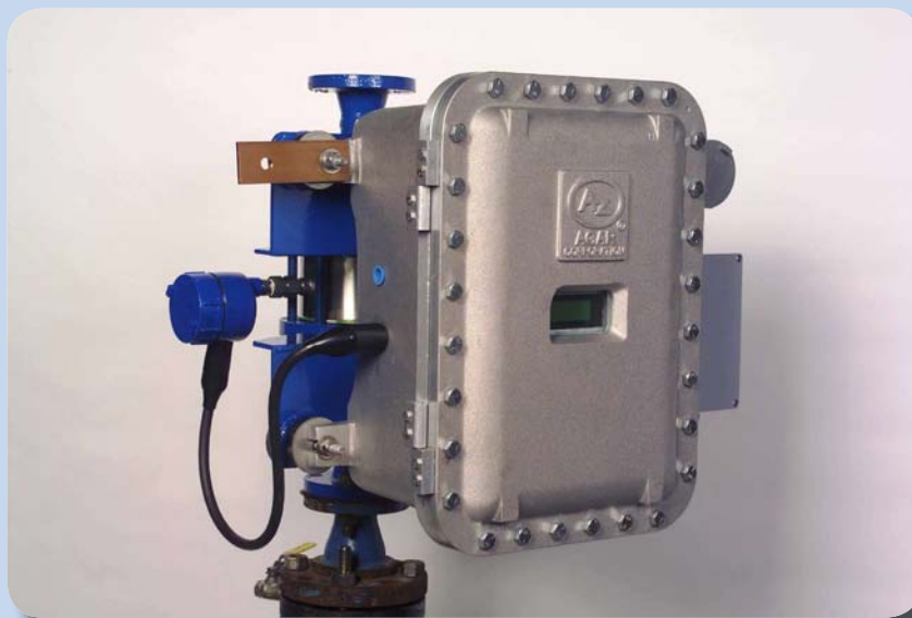
OW 201 Series